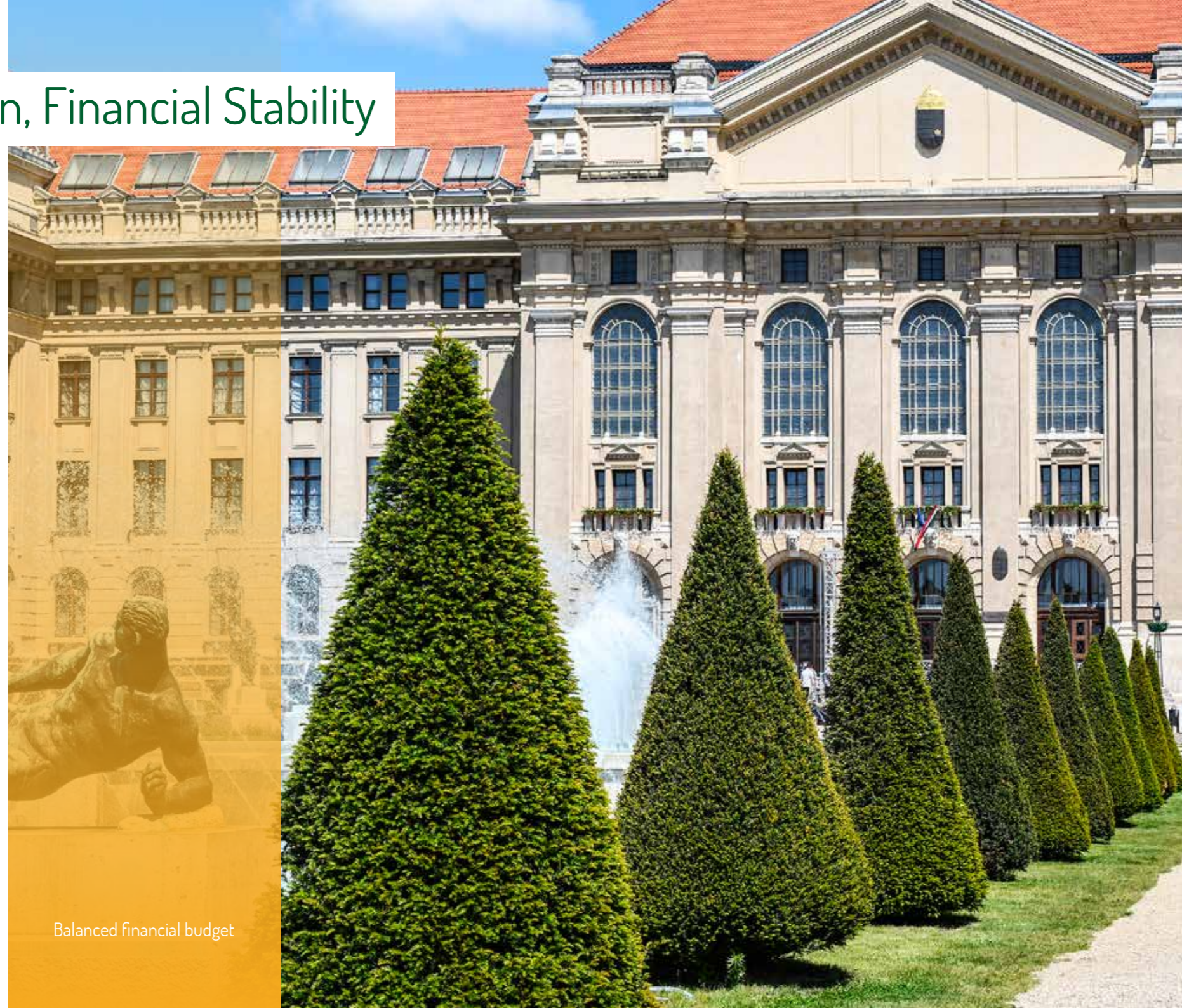
Balanced financial budget

The aim of this Hungarian higher education institution with the largest budget is to increase its revenues by achieving the most efficient use of its capacities, designing services fitted to market needs, and completing its tasks at a high standard. The university has a stable budget and a reassuring vision for the future.