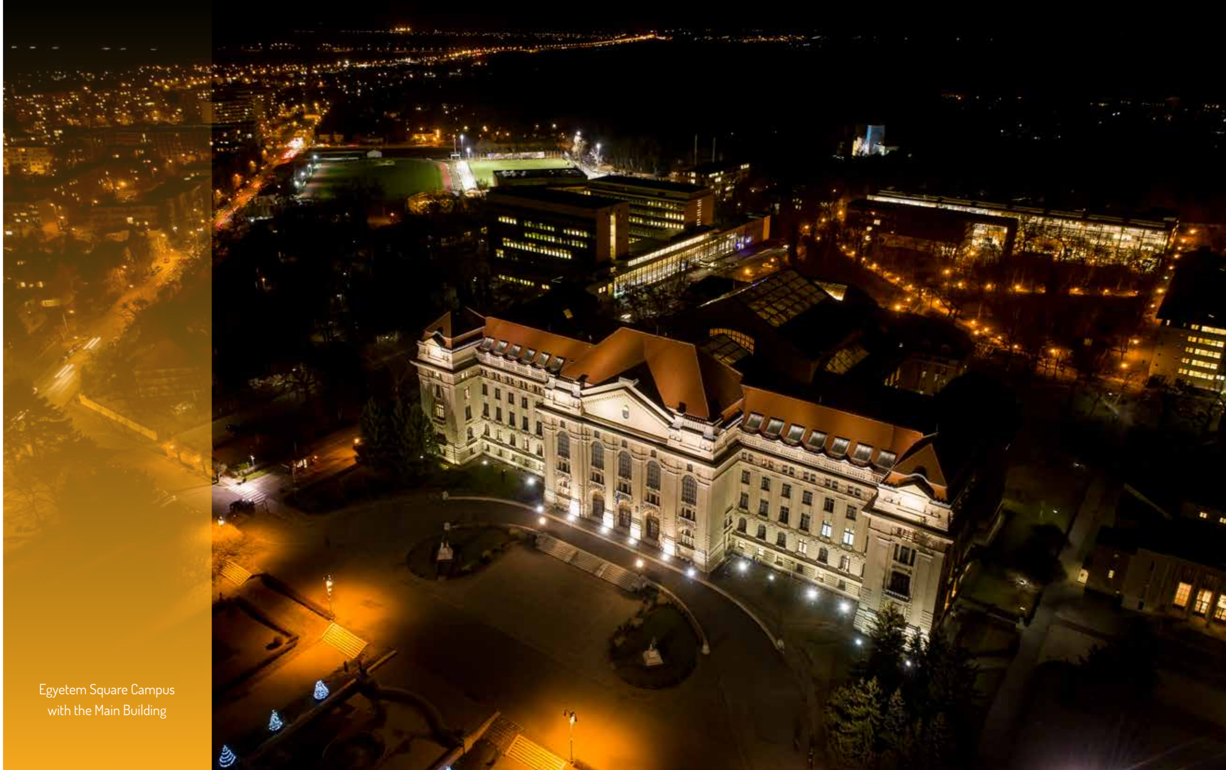
Egyetem Square Campus with the Main Building