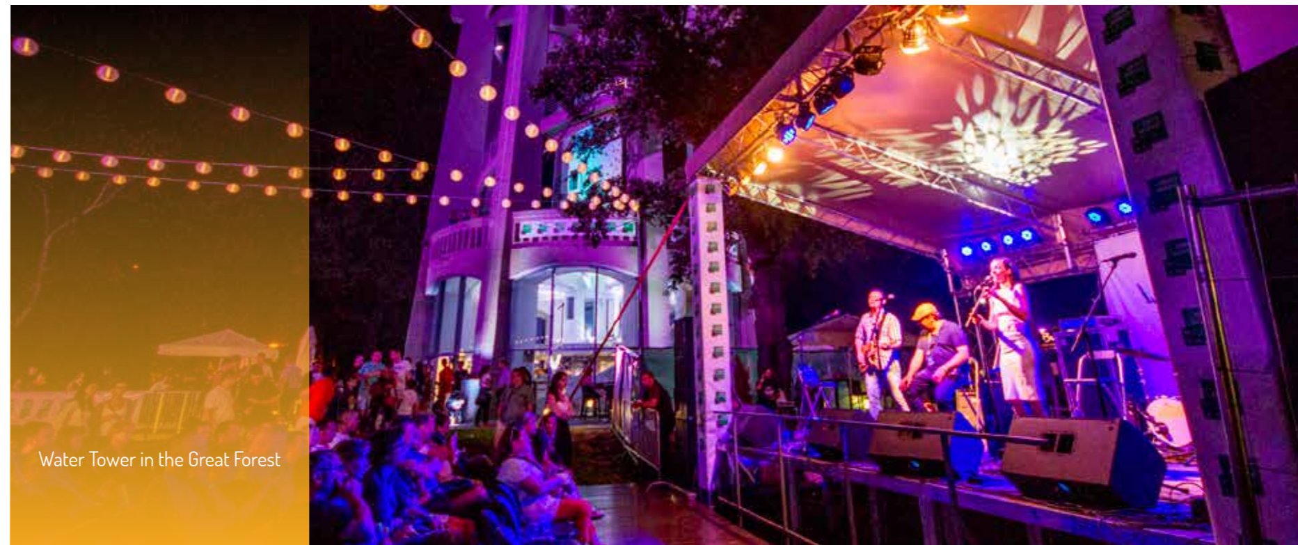
Water Tower in the Great Forest

In addition to program-based collaborations , the institution and the city are also looking for further possibilities to cooperate in the field of sports and healthy lifestyle, including the joint development and operation of infrastructure and services.