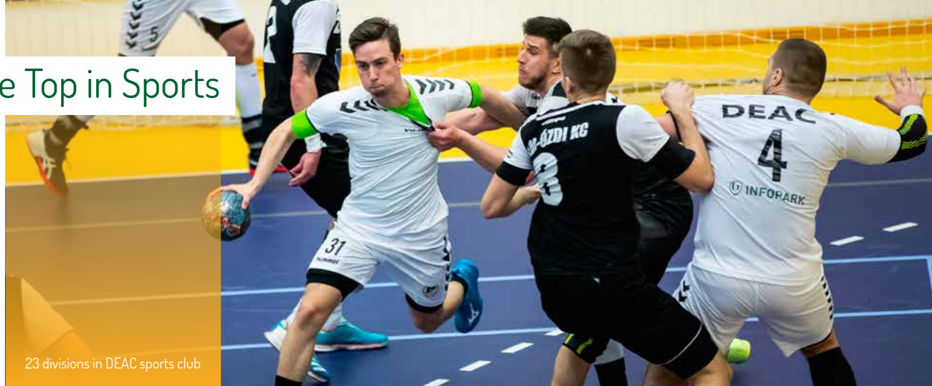
23 divisions in DEAC sports club

More than 2,700 athletes compete in the traditional black-and-white colors of DEAC, which with its 23 divisions is the largest university club in Hungary. With its unique mentoring program, beautiful and modern infrastructure, and novel initiatives it has become a model in Hungarian higher education.