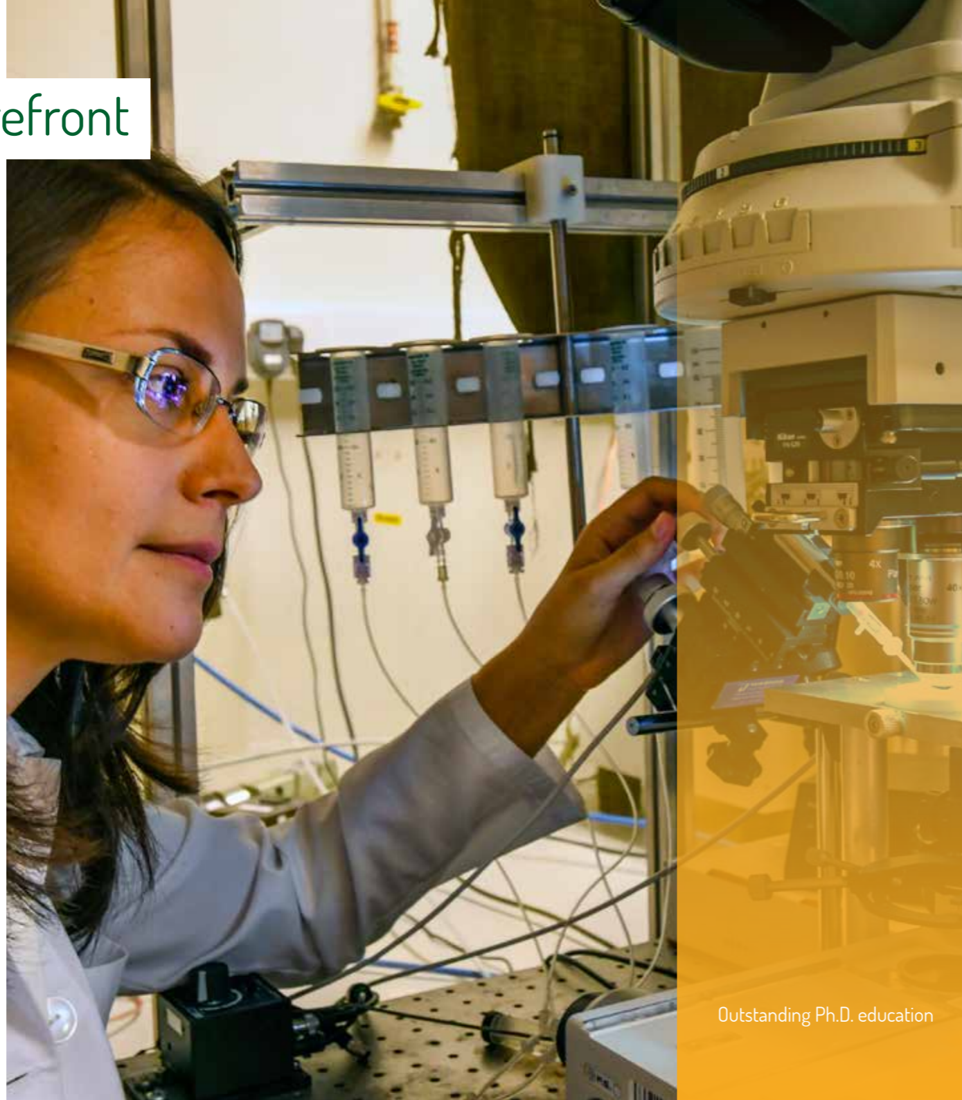
Outstanding Ph.D. education

The proportion of faculty members and researchers with a Ph.D. or equivalent degree is outstanding nationally, and this indicator places the institution in a leading position in the country.