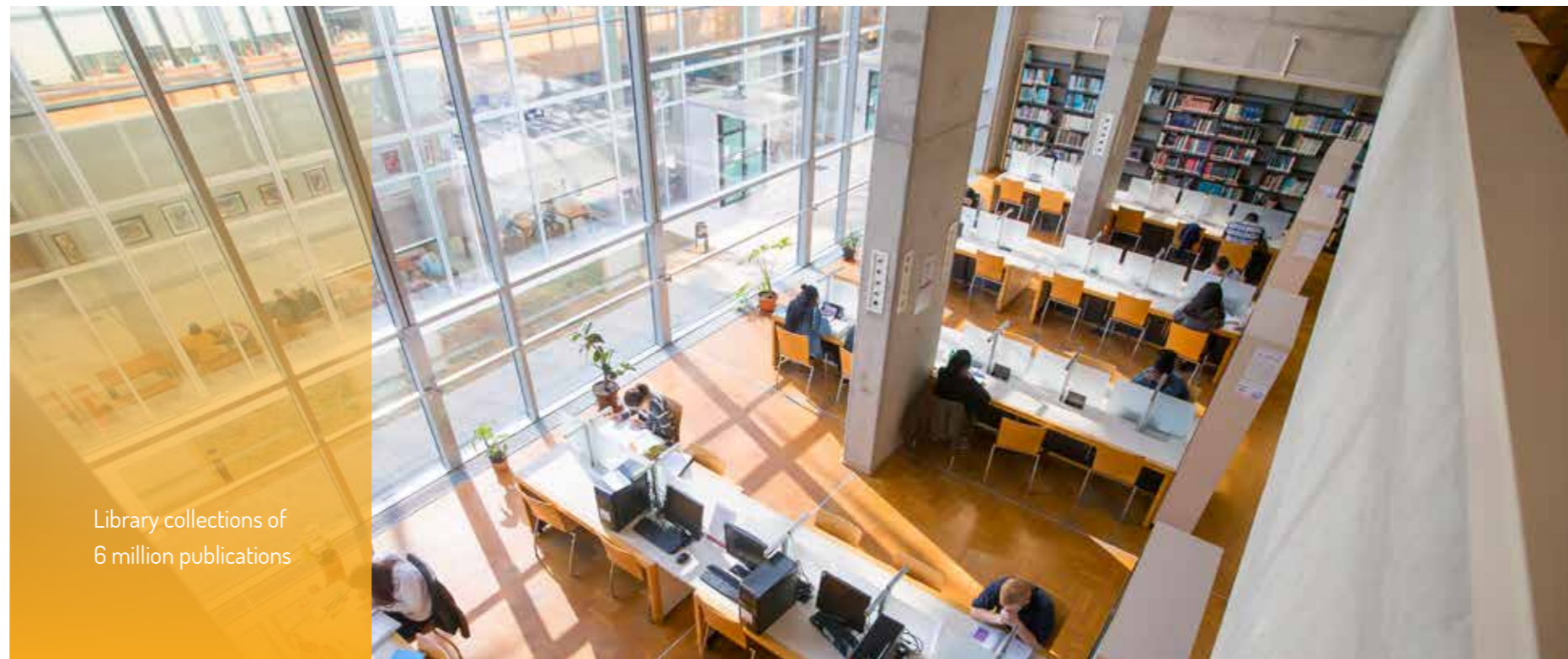
Library collections of 6 million publications

The University and National Library of the University of Debrecen is the second largest library in the country and one of the largest service units of the university. It offers users a collection of more than 6 million publications, in eight library units on the university's six campuses with spacious reading areas, a modern service environment, and its own digital archives. The university pays special attention to maintaining good relations with students graduating from the University of Debrecen or its predecessor institutions. In 2011, the Alumni Community was founded, which has more than 27,000 members as of 2020.