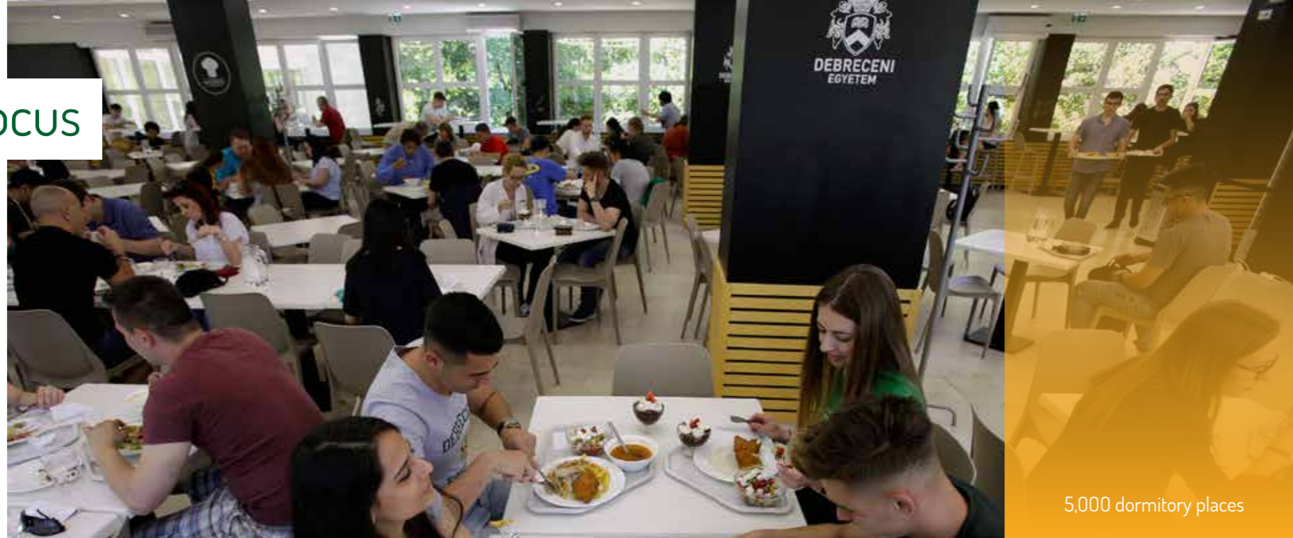
5,000 dormitory places

The University of Debrecen has 14 dormitory units with almost 5,000 dormitory places available. A minimum of 86% of applicants have received dormitory accommodation in the past five years which is outstanding nationwide. This capacity will be further expanded with a seven-year dormitory development program that will provide more than 200 new rooms built on campus by 2023.