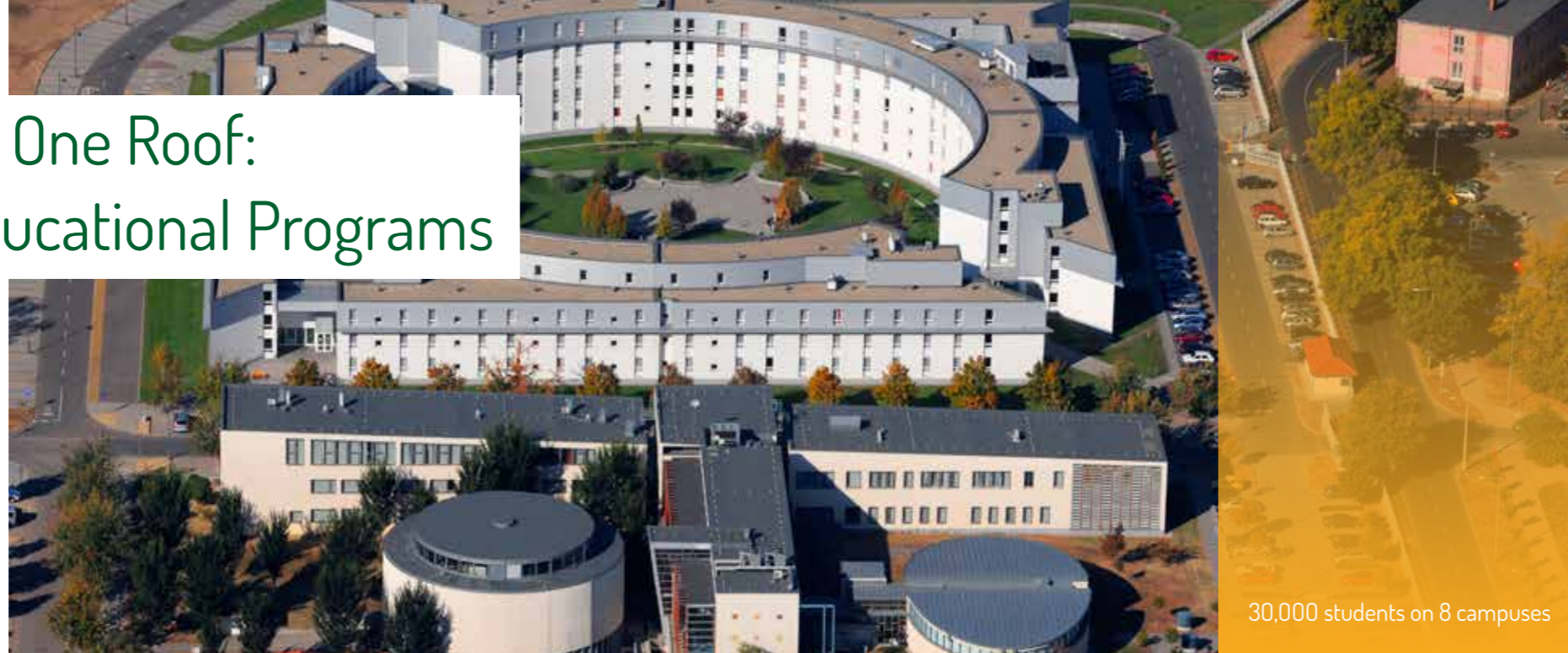
30,000 students on 8 campuses

In addition to programs offered in Hungarian, students arriving from abroad may also sign up for English-language programs. The research and development activities of more than 1,700 faculty members , the knowledge and experience of approximately 500 practical experts working at off-site departments ensure that our graduates can enter the labor market with a competitive diploma.