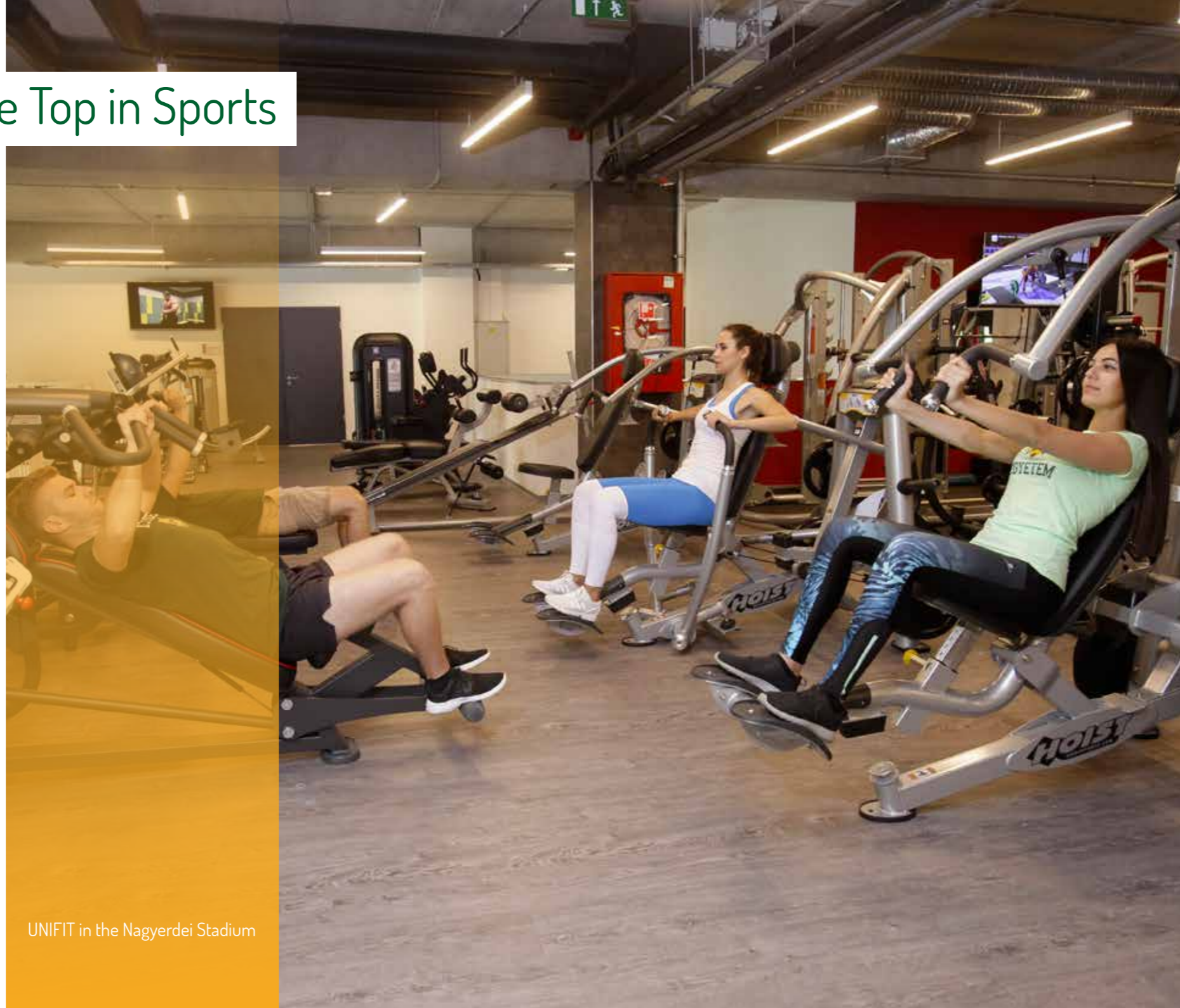
UNIFIT in the Nagyerdei Stadium

The university offers diverse sports services and opportunities, which include the sports science programs (bachelor's and master's, post-graduate programs), broadening national and international relations, and the coordination of the Sports Diagnostics, Lifestyle and Therapy Center located in the Nagyerdei Stadium with over 1,200 m 2 . There are also regular physical education opportunities for students, mass sporting events for the enjoyment of leisure time, as well as opportunities for highly talented students to participate in competitive sports in addition to learning.