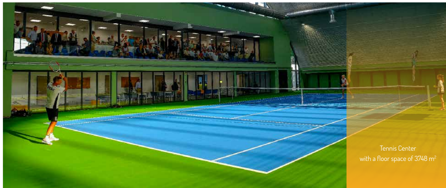
Tennis Center with a floor space of 3748 m 2

The University of Debrecen is exemplary among Hungarian education institutions not only in educating students and employees in a healthy lifestyle but also in its commitment to the development of sports facilities necessary for the performance of such activities.